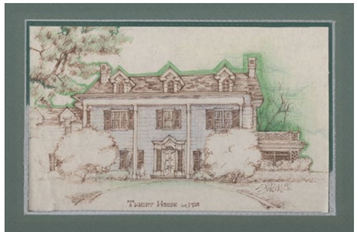
Early Sketch of Tigert House